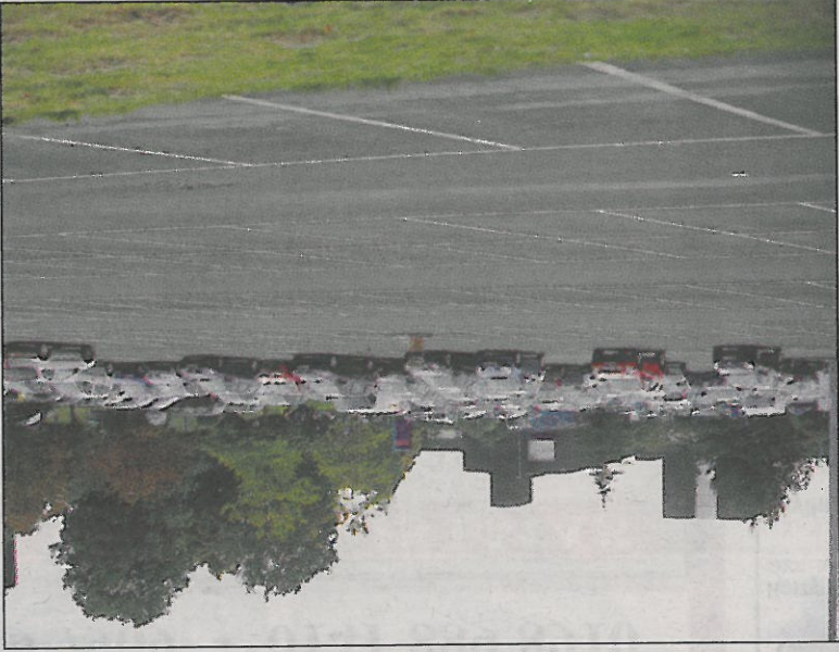
SCENE: The RAH car park

help some elderly people to know about the Scottish Helpline for Older People.